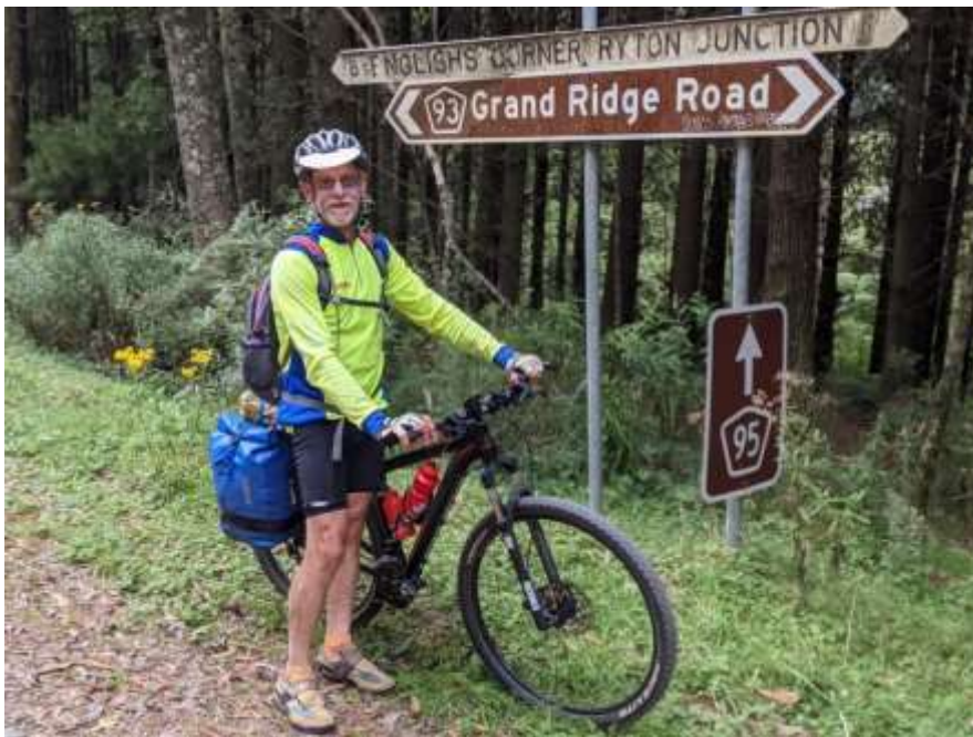
Preparing for the Ride for Sight challenge

Are you ready for this year's Challenge?