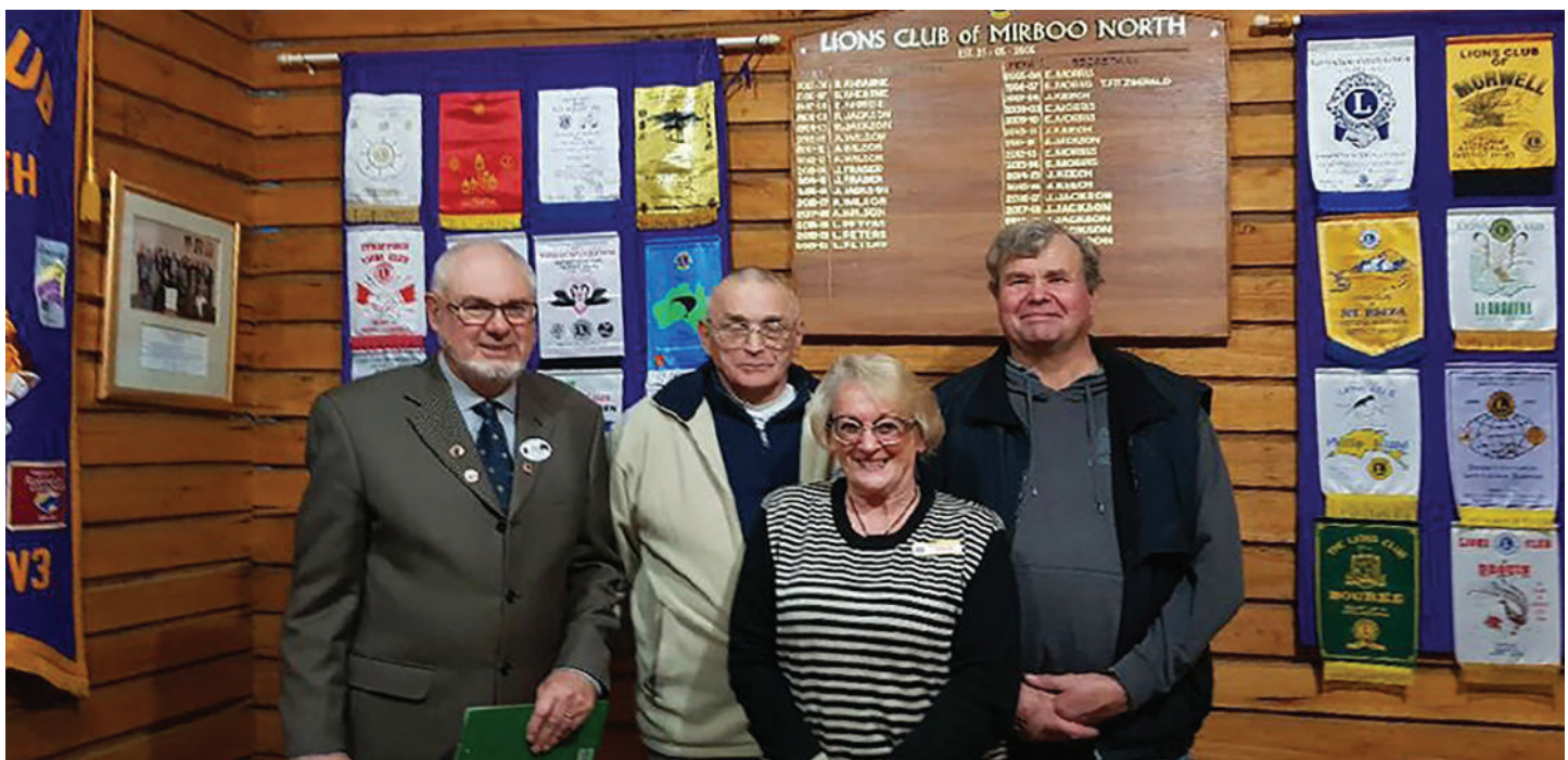
Above is a photo from the induction of the new members at the Lions Club of Mirboo North.