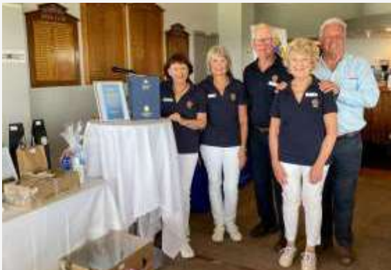
The Lions team with our auctioneer