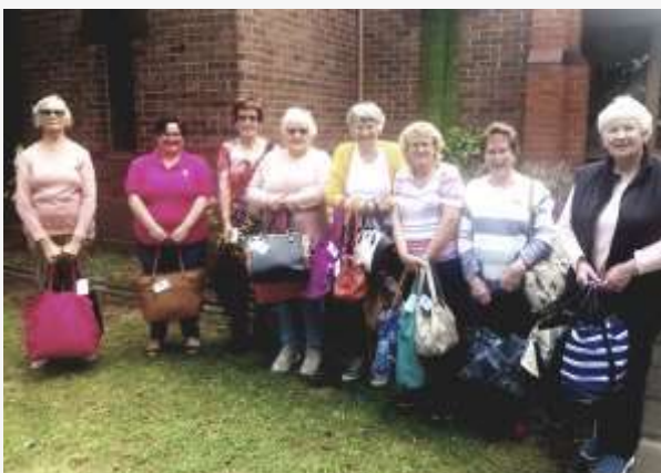
MAFFRA LIONS Lionesses with bags packed for Dignity Australia.

We are now planning our fundraising activities, hopefully we won't be interrupted by COVID.