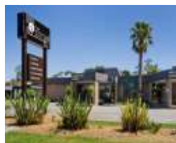
The Reserve Hotel, Sale