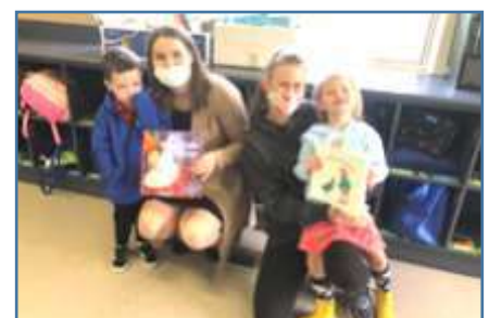
Preschool families sharing books.

For further information about this project please contact the Bairnsdale Advertiser's office.