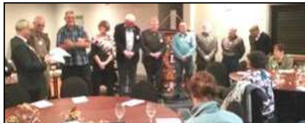
New Board of Traralgon Lions Club