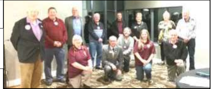
New Board of Drouin Lions Club