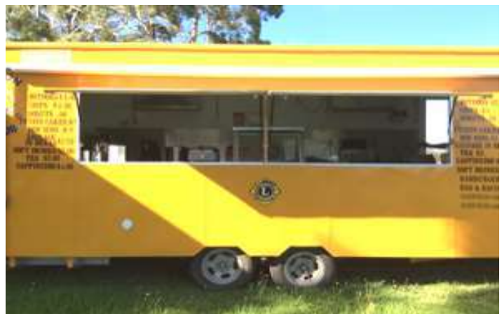
Yarragon catering van is still for sale - asking price $35,000 ONO.

For more details please contact Joe VanDenBroek on 0409 059