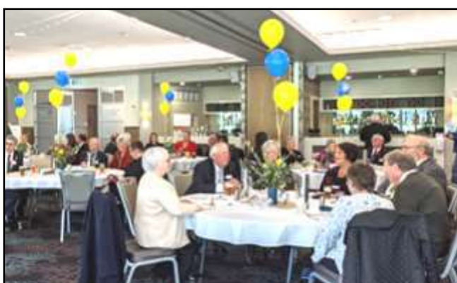
Members enjoying Lunch at the District Changeover