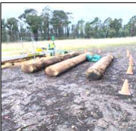
Bushfire affected trees ready for milling