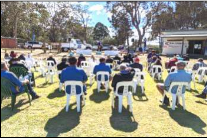
The opening of the East Gippsland Timber Milling Project