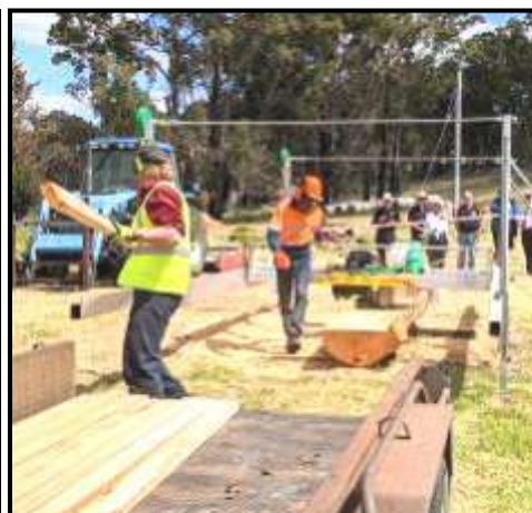
Logs being milled