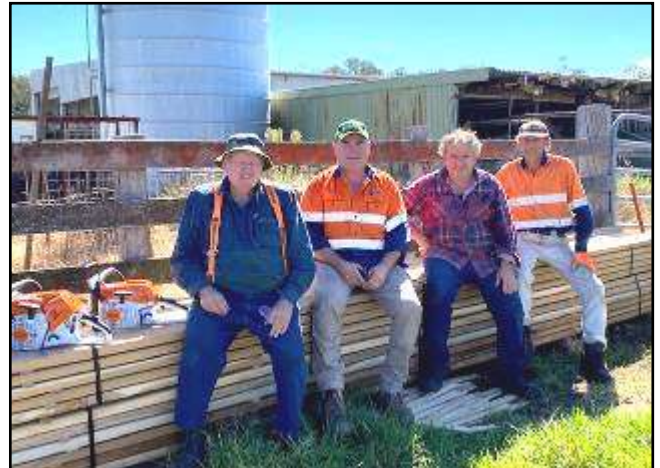
Local workers have been employed in the project

The Lions Club of Bruthen have created an exciting new project supporting the recovery of farmers from the devastating 2019/2020 bushfires. The East Gippsland Timber Milling Project was launched late February and is growing rapidly. A partnership project with Rotary its developed great relationships with government and non- government organisations. Supporters includer Australian Lions Foundation, Department of Environment, Land, Water and Planning, Bushfire Recovery Victoria and the newest partner the Minderoo Foundation. There has also been several Clubs from the District that have supported this great project and we say thanks for that.