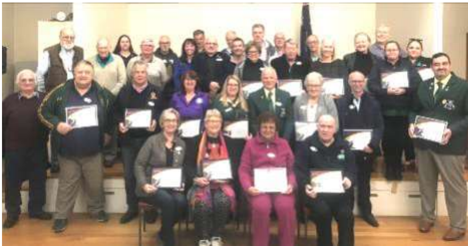
The District team for 20-21 Lions year at the final Cabinet meeting on May 16