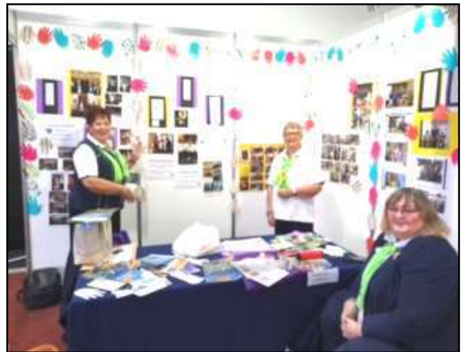
Lioness display at the convention