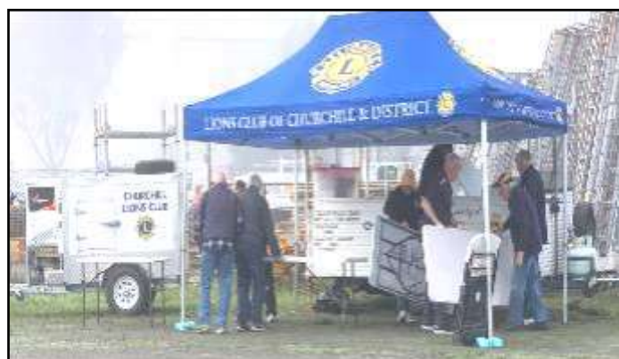
Setting up for a busy day

Once finished, it was pack up, clean up and away we all drove in convoy again back to the Shed to unhook, unload and sit for a yak.