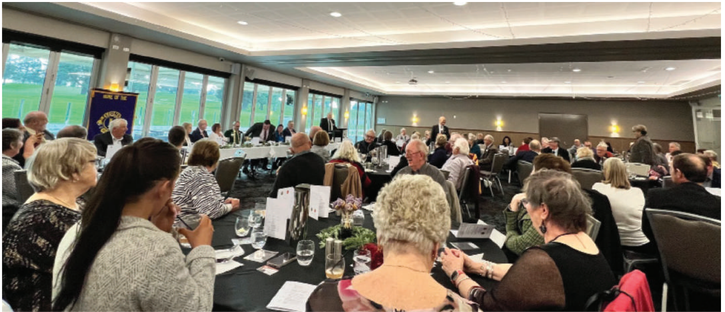
The Annual District Changeover was held on the 17 th July, 2022 at Warragul Country Club.