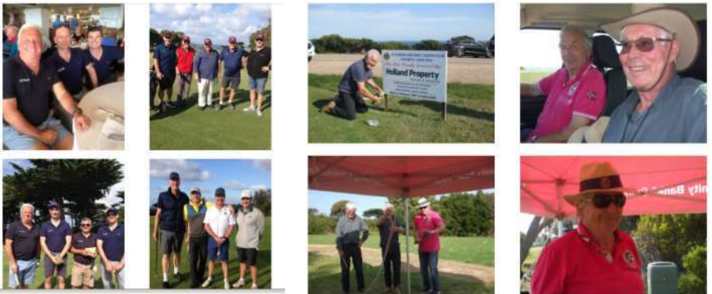
The Lions Team putting up signs for hole sponsors and erecting our sponsor's Marquee.

We raised over $21,000 on the day and are so pleased to be able to distribute these funds to the charities and causes we support, especially in these difficult times.