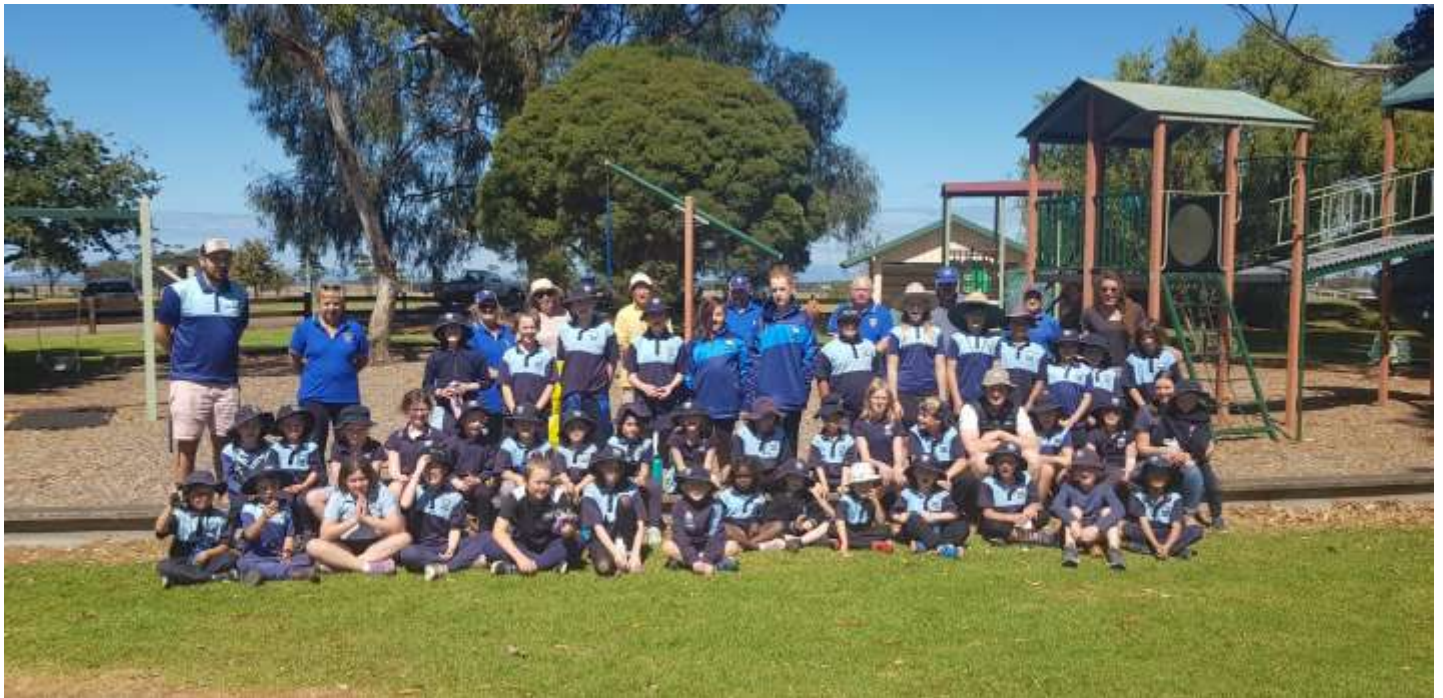
The Toora Primary School children giving the Lions a helping hand for clean up Australia Day. 10/03/2021.