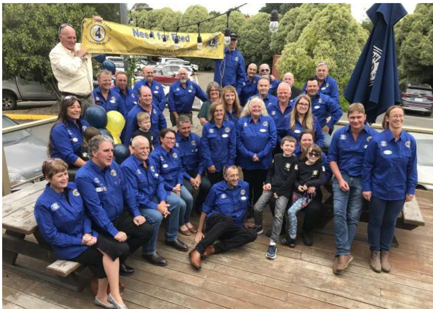
The new Lions Club of Victoria Need for Feed chartered with 38 members.