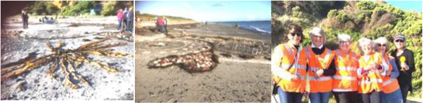
The art installation constructed with found items at the beach by local artist, Stewart Westle on the beach at Flinders.