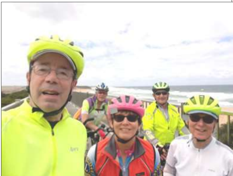
On the Kilcunda trestle bridge

Traralgon riders have also been out and about, with regular rides on Monday, Wednesday and Friday mornings chalking up about 200 km in two weeks to date. They also took off for a few days in South Gippsland from Tuesday to Friday last week. You might recall the weather in that period!! A planned 310 km over four days turned into around 210 km in three days, but nevertheless a very enjoyable time was had exploring the rail trails, bike paths and quieter roads in the region between Inverloch, Meeniyan and Cowes.