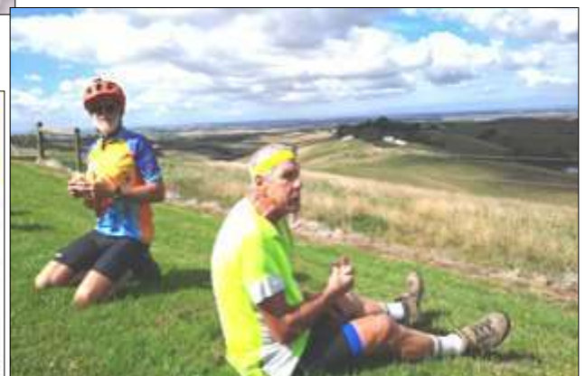
Lunch enjoying the view from the top of Trew Road