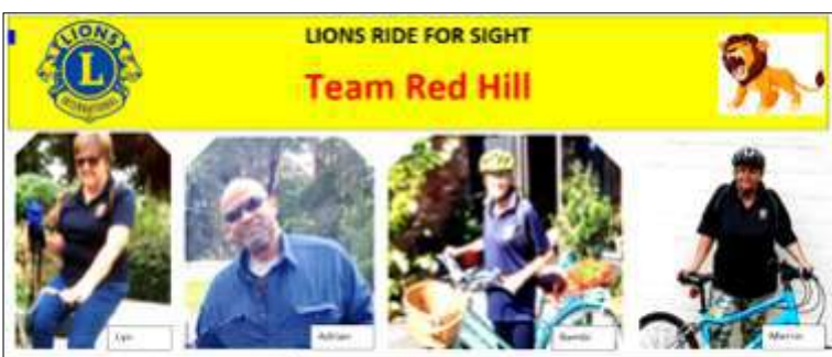
Team Red Hill, all riding independently, but clocking up the kilometres!