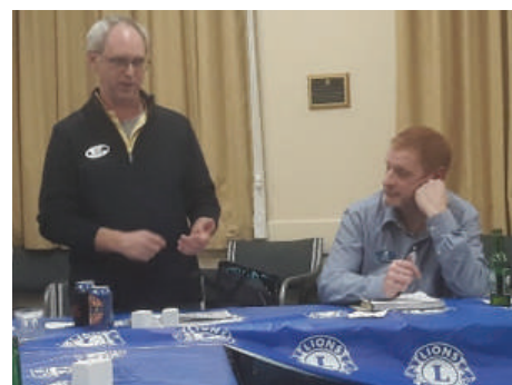
The images above are from DG David's recent visit to Port Chalmers Lion Club, New Zealand. It was a terrific night enjoyed by both the club's members and the District Governor.