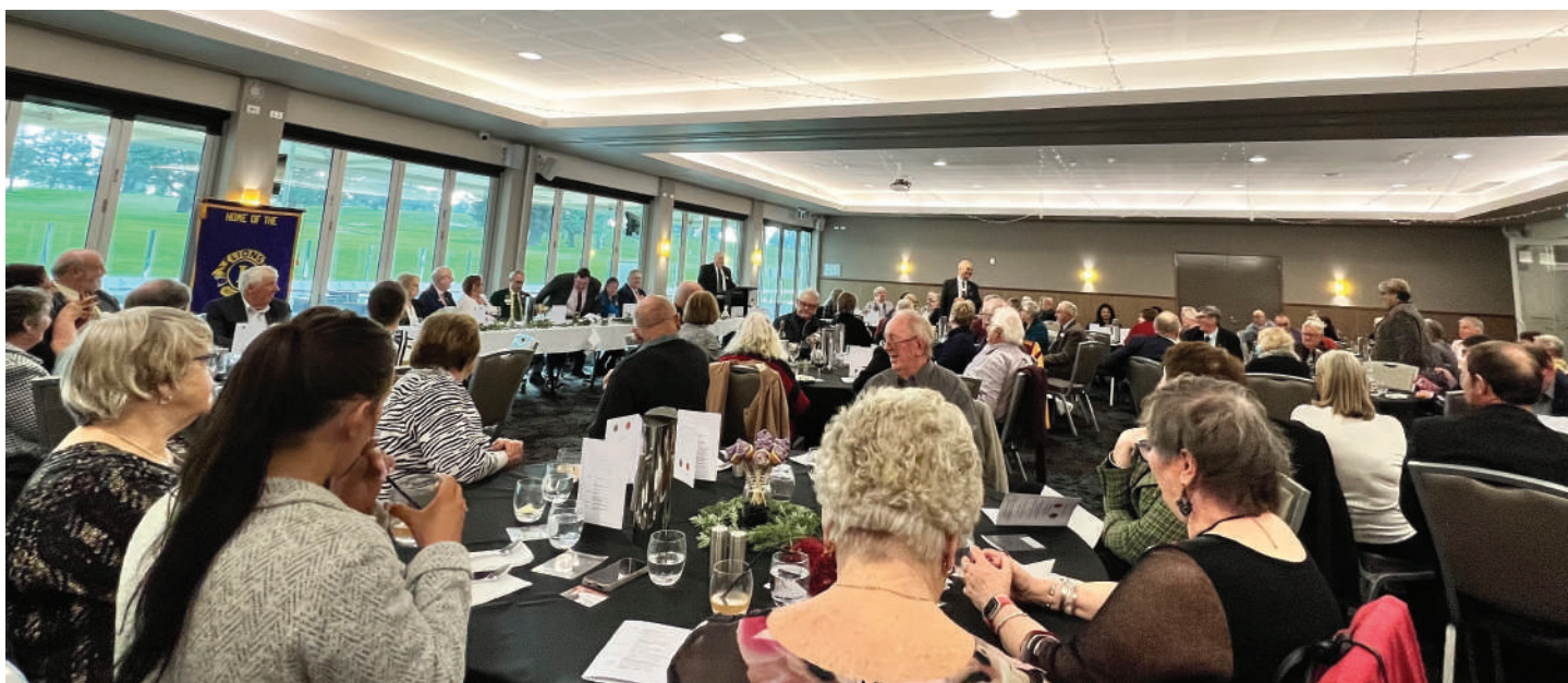
The Annual District Changeover was held on the 17th July, 2022 at Warragul Country Club