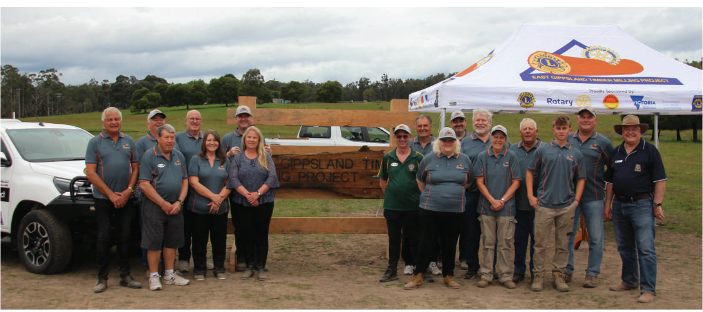
The Annual District Convention