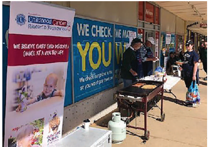
Above are photos from the Heyfield Club on the day working hard out in the sun.