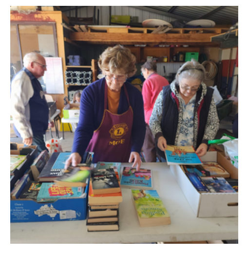
A recent book sorting day at the Lions Club of Moe Storage shed

Like elsewhere, books are very popular in the Latrobe Valley but even more so in Moe and Newborough, where members of the Lions Club of Moe have not one but two major book related community service projects.