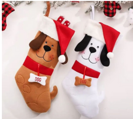
NEW Dog Christmas Stockings $8 each

Pictured here are some of our favourites and much more are available – you can order online at www.lionshearingdogs.com.au/shop