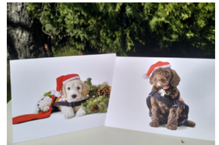
Puppy Xmas Cards (5 for $5 or 10 for $10)