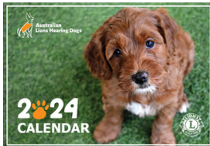
2024 Calendar $10