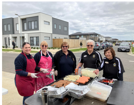
Casey Barbecue with Narre Warren