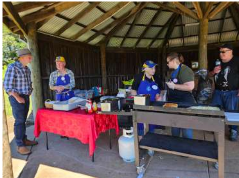
Mt Erica Lions catered for the Idlers 4x4 club two separate meals. One being a good old BBQ...

The Idlers group travel all over the countryside and we were fortunate enough to have them ask us to help cater for two of their meals. The club put thousands of dollars back into the communities they visit which is a wonderful thing to support small towns like Erica.