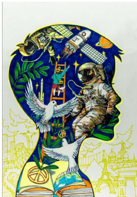
International Peace Poster Winner by Fanjin Si

From ones so young, their creativity is impeccable in all facets of Peace Poster.