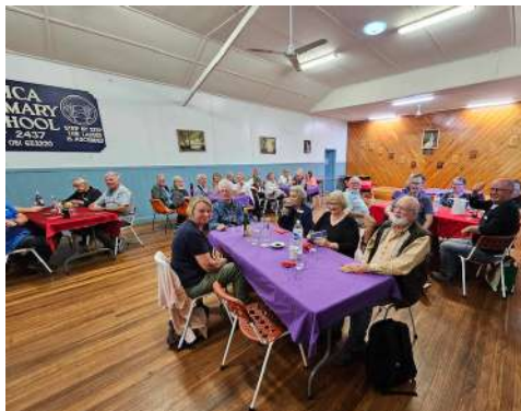
...and the other a sit down affair in the Erica hall.