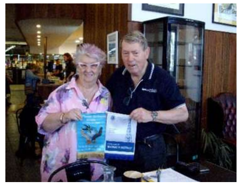
McCrae and District